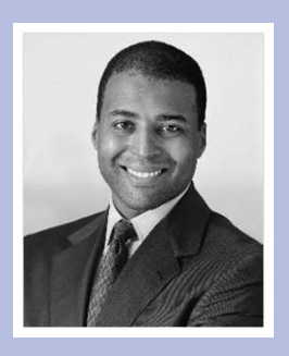
Director Since: 2018 Synchronoss Committees: