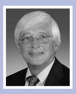
Director Since: 2007 Synchronoss Committees: • Audit (Chair)