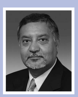
Director Since: 2019

The Board of Directors recommends that stockholders vote "FOR" the nominee listed below: